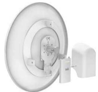
PtP Backhaul : S1200AX + WIS-AND5829D