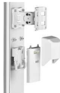
Sector Base Station : S1200AX + ANS5819-120